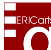
European Institute for Comparative Cultural Research (ERICarts)