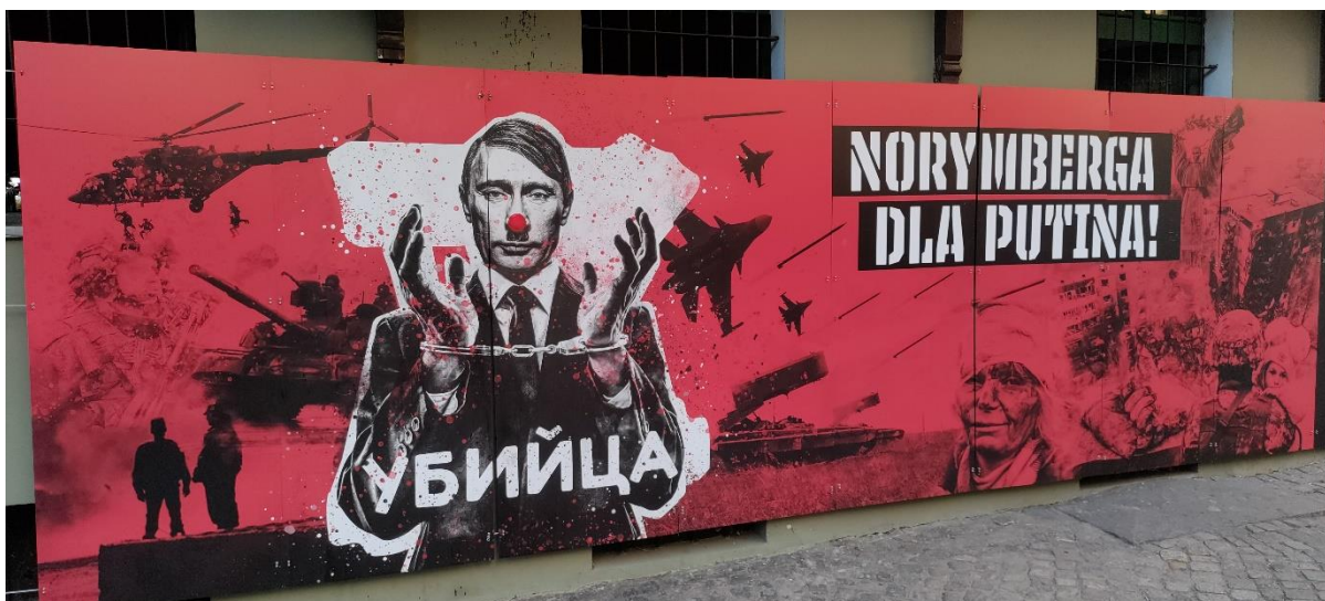
FIGURE 1. Putin is a Killer. Wrocław, Poland. July 2022.

Nevertheless, despite the visibility of this campaign, it failed to spur any legislative changes within the European Union. Instead, the entire ‘cancel Russian culture’ display was effectively co-opted by the Kremlin to propagate a narrative of self-victimisation. The emergence of the concept of ‘cancelling Russia’ on the Russian internet in March 2022 marked a significant development. Statistical analysis of the media landscape and Yandex search queries (Kotikova, 2022) indicates a gradual increase in interest among Russian users, a phenomenon that gained momentum throughout the summer of 2022. In contrast, data from English-speaking media sources show no global interest in the cancellation of Russian culture, suggesting that the hysteria remains confined to users of Russian media.