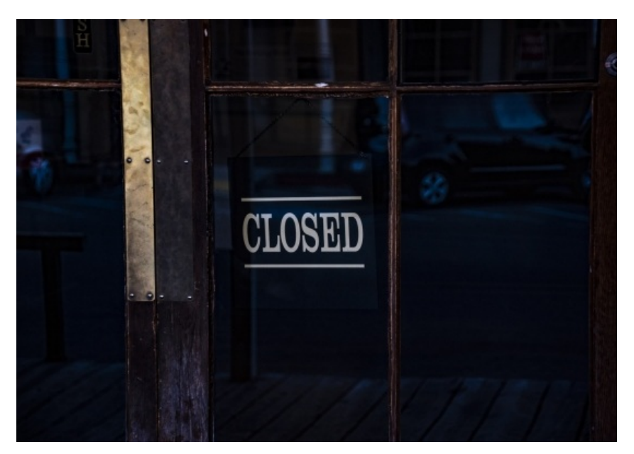
<u>Updated COVID-19 reports from Austria, the Czech Republic, Ireland and Spain</u>